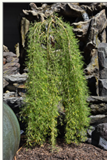
Walker Weeping Caragana