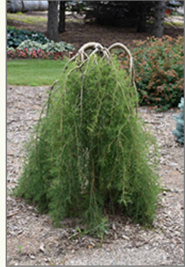
Walker Weeping Caragana

#7 container - $159.99 * Sizes and availability are subject to change. Please check with the store for specific details.