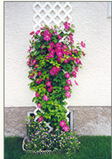
Ville de Lyon Clematis in bloom