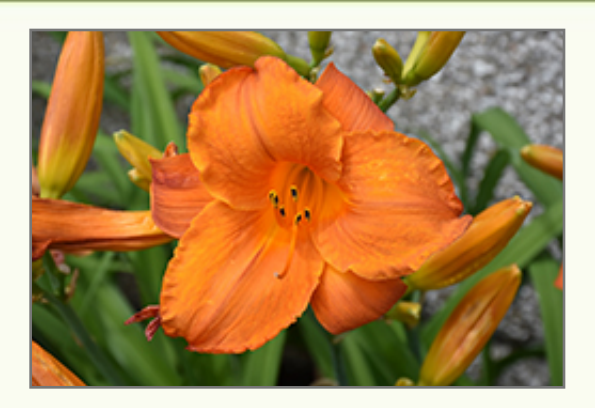
Mauna Loa Daylily flowers

Plant Height: 18 inches Flower Height: 24 inches Spread: 18 inches Spacing: 14 inches Sunlight: O O Hardiness Zone: 3a