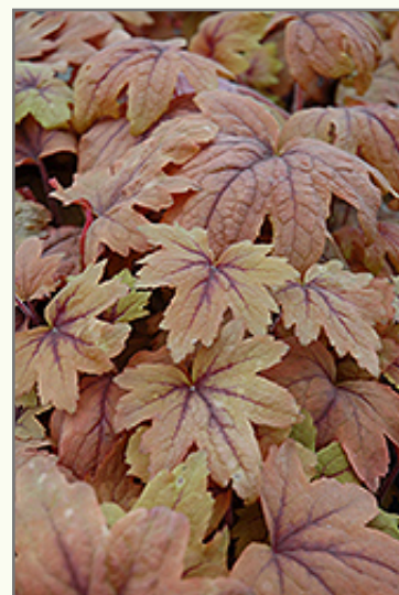
Sweet Tea Foamy Bells foliage