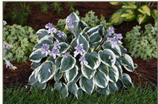
First Frost Hosta in bloom