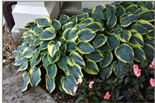
First Frost Hosta