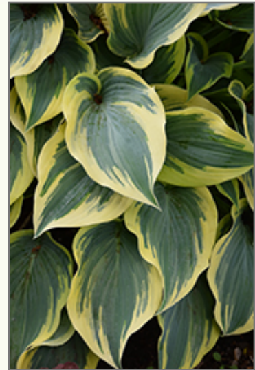
First Frost Hosta foliage