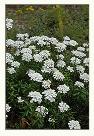
Purity Candytuft flowers