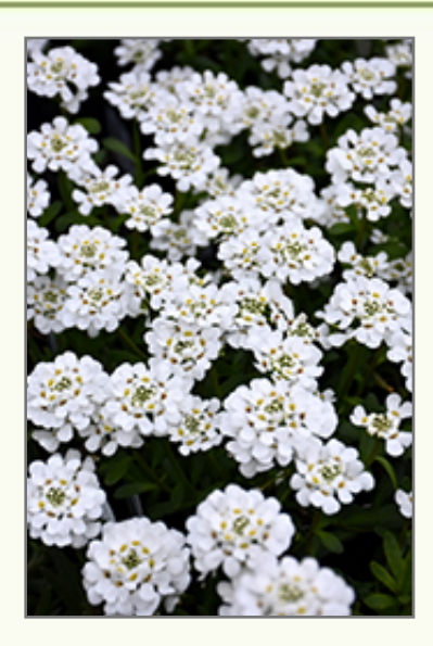
Purity Candytuft flowers