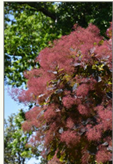
Grace Smokebush flowers