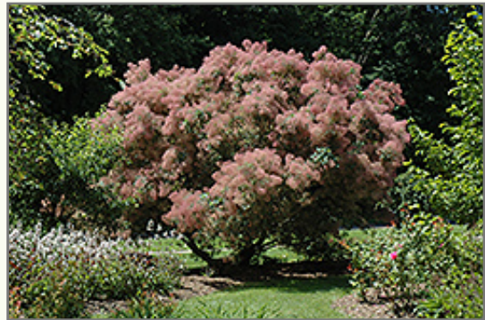
Grace Smokebush in bloom

This shrub will require occasional maintenance and upkeep, and is best pruned in late winter once the threat of extreme cold has passed. Deer don't particularly care for this plant and will usually leave it alone in favor of tastier treats. It has no significant negative characteristics.