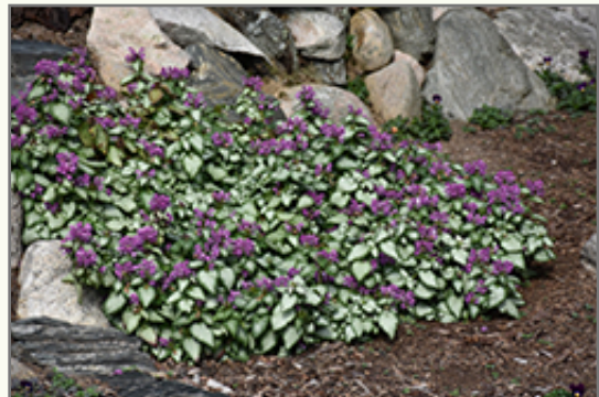
Purple Dragon Lamium in bloom