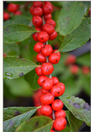
Red Sprite Winterberry fruit

This shrub will require occasional maintenance and upkeep, and is best pruned in late winter once the threat of extreme cold has passed. It is a good choice for attracting birds to your yard. Gardeners should be aware of the following characteristic(s) that may warrant special consideration;