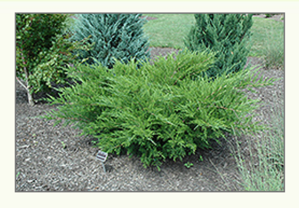
Sea Green Juniper

This is a high maintenance shrub that will require regular care and upkeep, and is best pruned in late winter once the threat of extreme cold has passed. Deer don't particularly care for this plant and will usually leave it alone in favor of tastier treats. It has no significant negative characteristics.