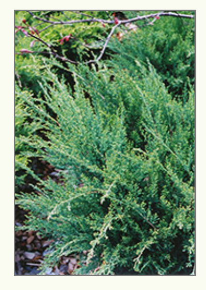
Sea Green Juniper foliage