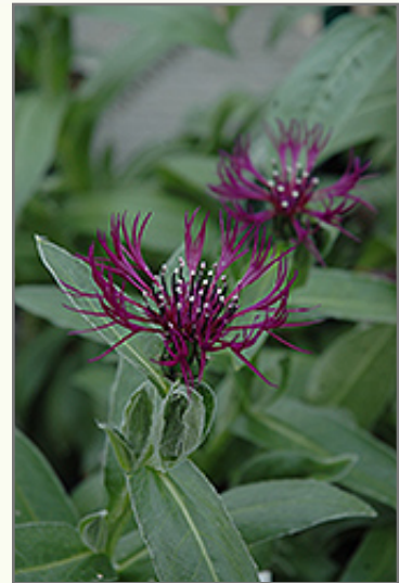
Amethyst Dream Cornflower flowers

Amethyst Dream Cornflower is recommended for the following landscape applications;