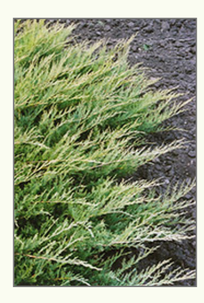
Broadmoor Juniper foliage