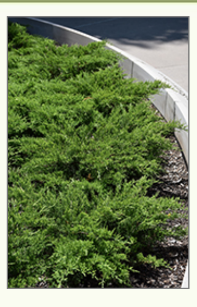
Broadmoor Juniper