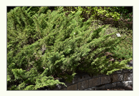
Scandia Juniper

Scandia Juniper is recommended for the following landscape applications;