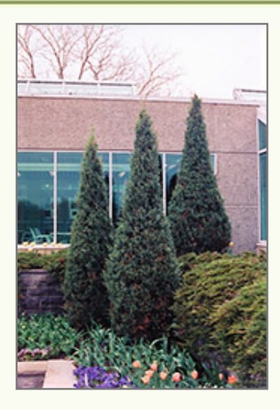
Skyrocket Juniper

An extremely narrow, rigid tall evergreen shrub, with soft blue-green needle-like foliage all season long; use with caution, can be rather abrupt in the landscape, makes a curious, almost formal tall evergreen hedge when planted in a row