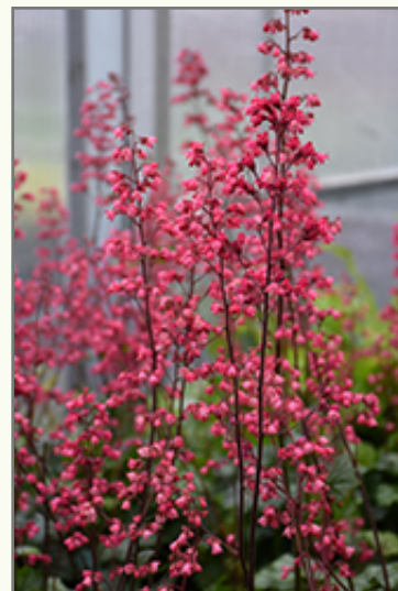
Paris Coral Bells flowers