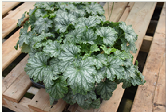
Paris Coral Bells foliage