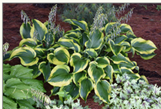
Atlantis Hosta