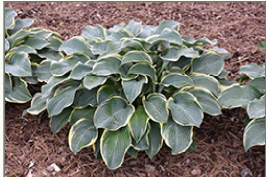
Regal Splendor Hosta