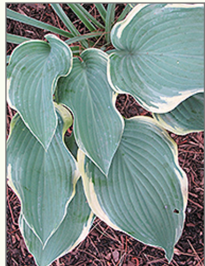
Regal Splendor Hosta foliage