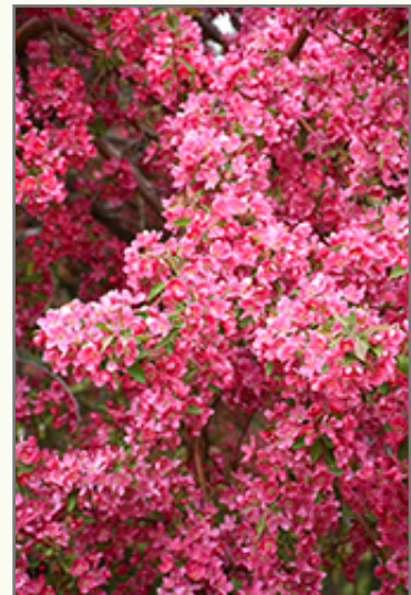
Prairiefire Flowering Crabapple flowers