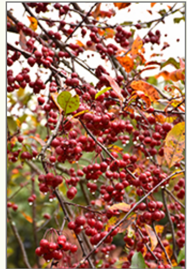
Prairiefire Flowering Crabapple fruit