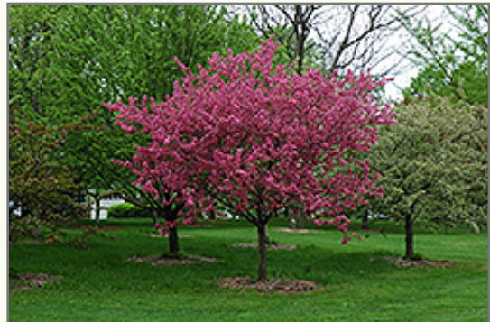
Prairiefire Flowering Crabapple in bloom

Prairiefire Flowering Crabapple is a deciduous tree with an upright spreading habit of growth. Its average texture blends into the landscape, but can be balanced by one or two finer or coarser trees or shrubs for an effective composition.