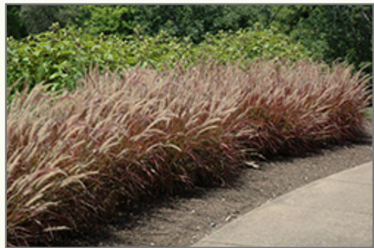
Purple Fountain Grass in bloom

Purple Fountain Grass will grow to be about 4 feet tall at maturity, with a spread of 3 feet. Although it's not a true annual, this plant can be expected to behave as an annual in our climate if left outdoors over the winter, usually needing replacement the following year. As such, gardeners should take into consideration that it will perform differently than it would in its native habitat.