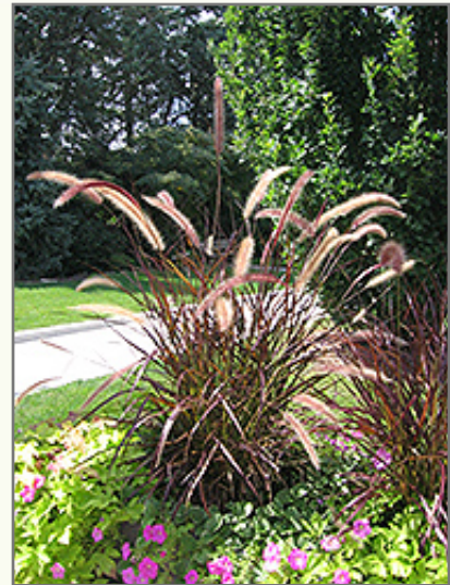
Purple Fountain Grass flowers

Purple Fountain Grass is recommended for the following landscape applications;