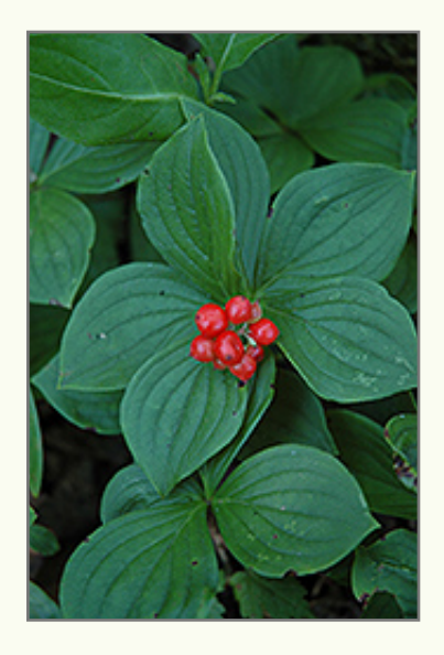
Bunchberry Dogwood fruit