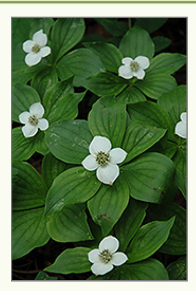
Bunchberry Dogwood flowers

Bunchberry Dogwood is recommended for the following landscape applications;