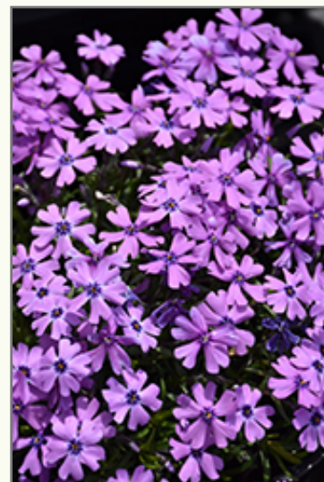
Purple Beauty Creeping Phlox flowers

This plant will require occasional maintenance and upkeep, and should only be pruned after flowering to avoid removing any of the current season's flowers. Deer don't particularly care for this plant and will usually leave it alone in favor of tastier treats. Gardeners should be aware of the following characteristic(s) that may warrant special consideration;