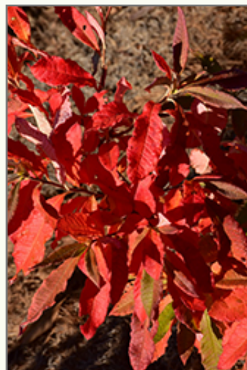
Rosy Lights Azalea in fall