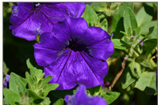
Easy Wave Blue Petunia flowers