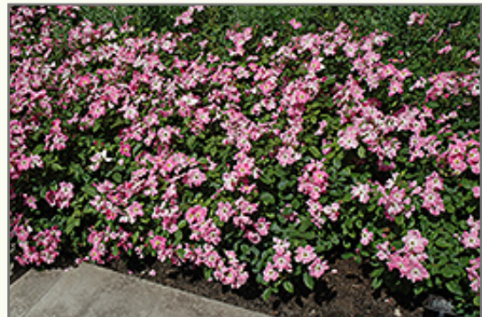
Nearly Wild Shrub Rose in bloom