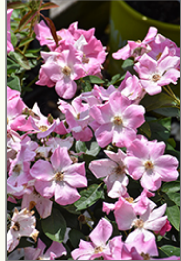
Nearly Wild Shrub Rose flowers

This is a high maintenance shrub that will require regular care and upkeep, and is best pruned in late winter once the threat of extreme cold has passed. Gardeners should be aware of the following characteristic(s) that may warrant special consideration;