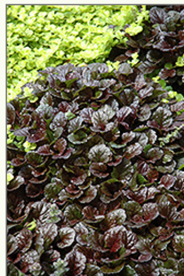
Black Scallop Ajuga