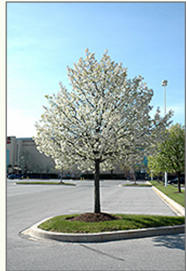
Jack® Flowering Pear in bloom