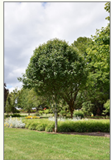
Jack® Flowering Pear