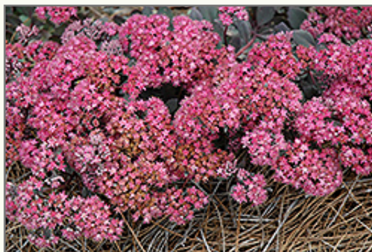
SunSparkler® Dazzleberry Sedum flowers

SunSparkler® Dazzleberry Sedum is a dense herbaceous perennial with an upright spreading habit of growth. Its medium texture blends into the garden, but can always be balanced by a couple of finer or coarser plants for an effective composition.