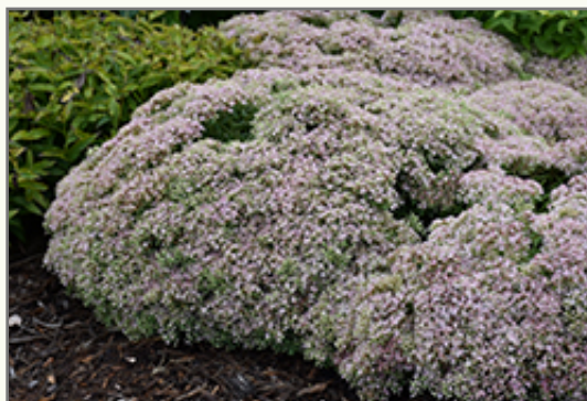
Rock 'N Round Pure Joy Stonecrop in bloom

Rock 'N Round Pure Joy Stonecrop is a dense herbaceous perennial with a mounded form. Its medium texture blends into the garden, but can always be balanced by a couple of finer or coarser plants for an effective composition.