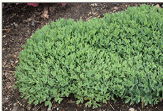
Rock 'N Round Pure Joy Stonecrop