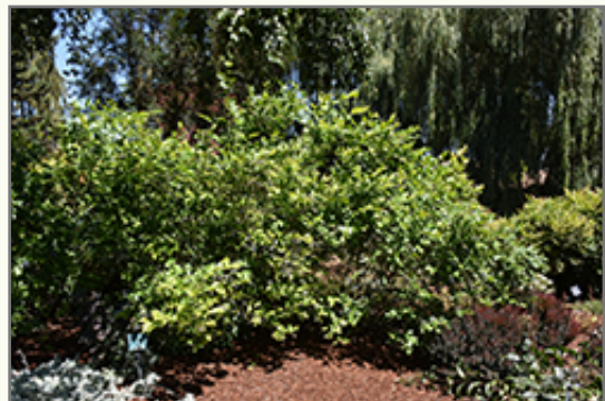
Northland Blueberry