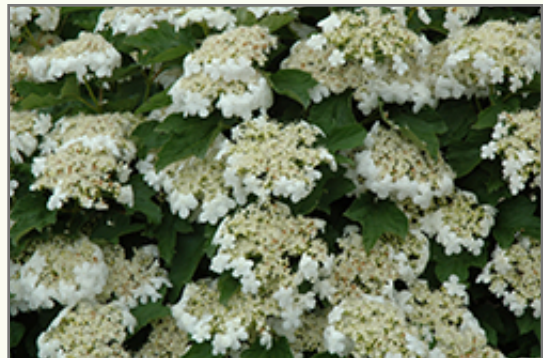
Compact European Cranberrybush flowers