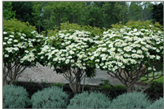
Compact European Cranberrybush in bloom

Compact European Cranberrybush is a dense multi-stemmed deciduous shrub with a more or less rounded form. Its average texture blends into the landscape, but can be balanced by one or two finer or coarser trees or shrubs for an effective composition.