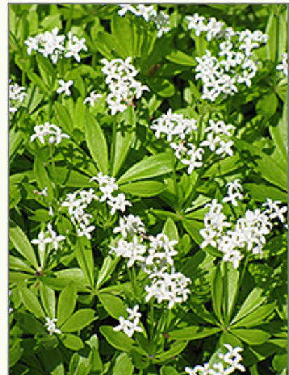
Sweet Woodruff flowers