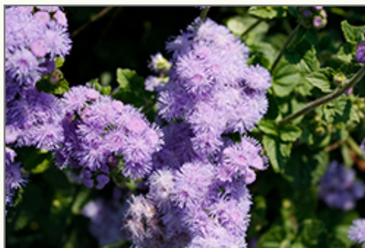
Blue Horizon Flossflower flowers

Blue Horizon Flossflower is a dense herbaceous annual with a mounded form. Its medium texture blends into the garden, but can always be balanced by a couple of finer or coarser plants for an effective composition.