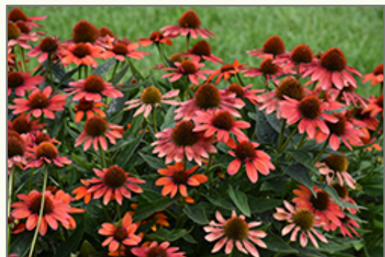
Sombrero Flamenco Orange Coneflower flowers