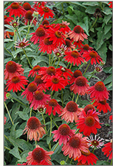
Sombrero® Salsa Red Coneflower flowers

Sombrero® Salsa Red Coneflower is an herbaceous perennial with an upright spreading habit of growth. Its medium texture blends into the garden, but can always be balanced by a couple of finer or coarser plants for an effective composition.