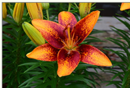
Tiny® Orange Sensation Asiatic Lily flowers