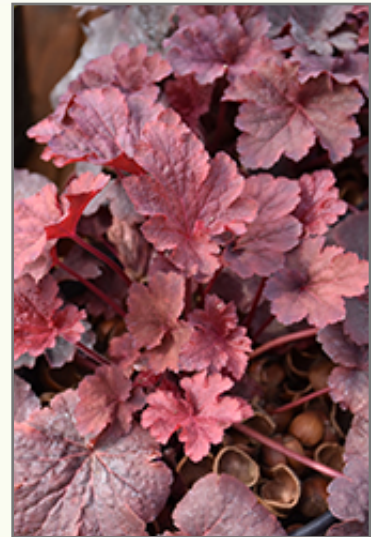
Cajun Fire Coral Bells foliage

Cajun Fire Coral Bells is recommended for the following landscape applications;