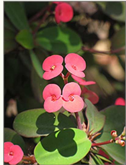
Crown Of Thorns flowers

This is a relatively low maintenance plant, and should only be pruned after flowering to avoid removing any of the current season's flowers. It is a good choice for attracting butterflies to your yard, but is not particularly attractive to deer who tend to leave it alone in favor of tastier treats. Gardeners should be aware of the following characteristic(s) that may warrant special consideration;