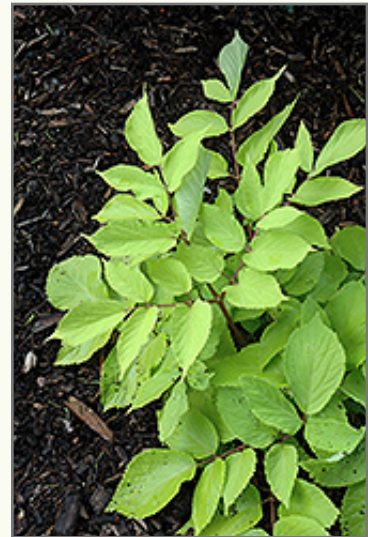
Sun King Aralia foliage