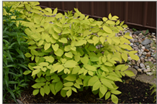
Sun King Aralia

This plant will require occasional maintenance and upkeep, and is best cut back to the ground in late winter before active growth resumes. It is a good choice for attracting birds and bees to your yard. Gardeners should be aware of the following characteristic(s) that may warrant special consideration;