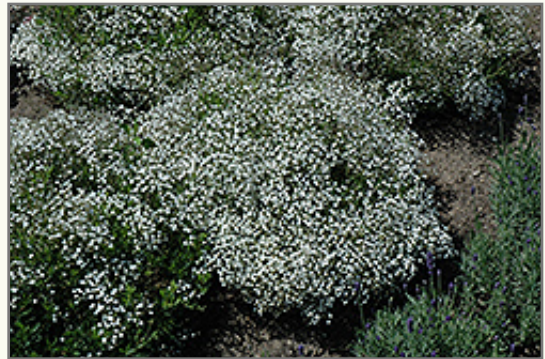
Summer Sparkles® Baby's Breath in bloom

Summer Sparkles® Baby's Breath will grow to be about 26 inches tall at maturity, with a spread of 3 feet. Its foliage tends to remain dense right to the ground, not requiring facer plants in front. It grows at a fast rate, and under ideal conditions can be expected to live for approximately 10 years. As an herbaceous perennial, this plant will usually die back to the crown each winter, and will regrow from the base each spring. Be careful not to disturb the crown in late winter when it may not be readily seen!