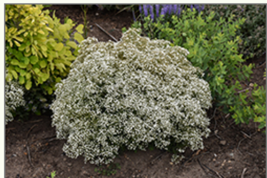
Summer Sparkles® Baby's Breath in bloom