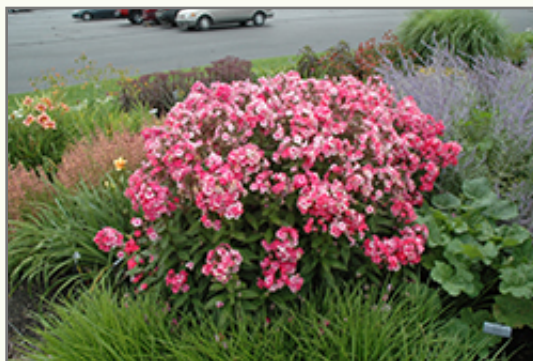
Garden Girls Glamour Girl Garden Phlox in bloom