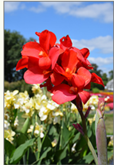
Cannova Bronze Scarlet Canna flowers

-- THIS IS A TROPICAL PLANT AND SHOULD NOT BE EXPECTED TO SURVIVE THE WINTER OUTDOORS IN OUR CLIMATE --