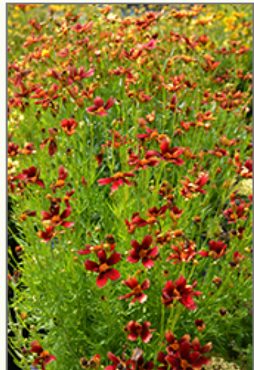
Red Satin Coreopsis flowers