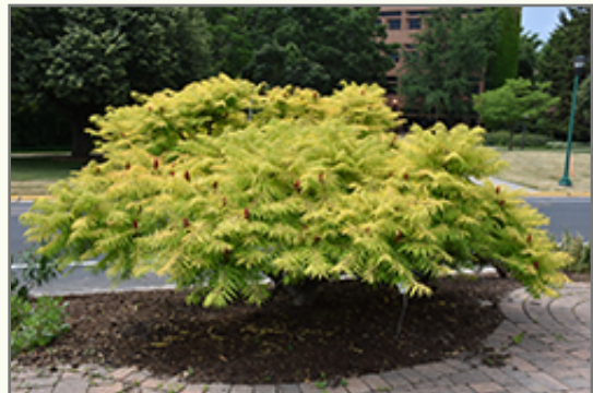
First Editions® Tiger Eyes® Cutleaf Staghorn Sumac