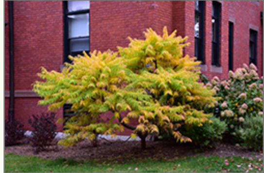
First Editions® Tiger Eyes® Cutleaf Staghorn Sumac in fall

This shrub will require occasional maintenance and upkeep, and is best pruned in late winter once the threat of extreme cold has passed. It has no significant negative characteristics.