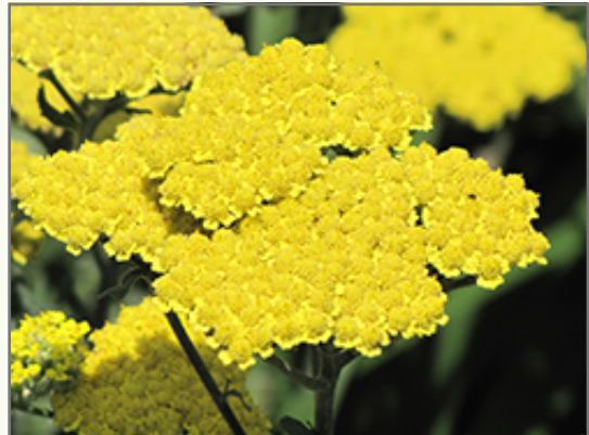
Moonshine Yarrow flowers