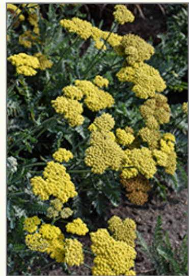
Moonshine Yarrow flowers

Moonshine Yarrow will grow to be about 24 inches tall at maturity, with a spread of 24 inches. It grows at a fast rate, and under ideal conditions can be expected to live for approximately 10 years. As an herbaceous perennial, this plant will usually die back to the crown each winter, and will regrow from the base each spring. Be careful not to disturb the crown in late winter when it may not be readily seen!