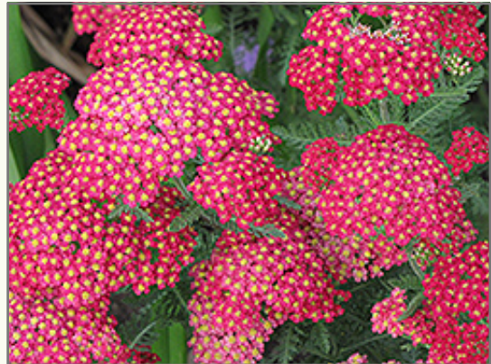
Paprika Yarrow flowers