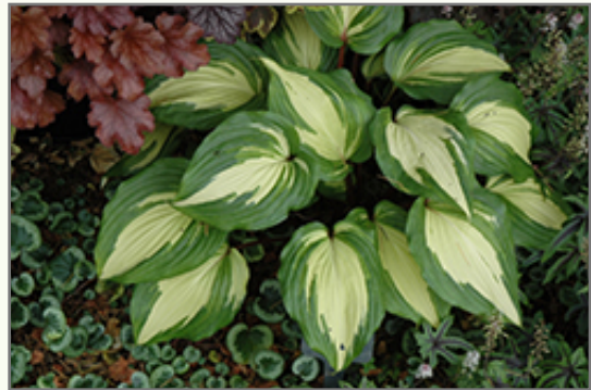
Raspberry Sundae Hosta

This is a relatively low maintenance plant, and is best cleaned up in early spring before it resumes active growth for the season. Gardeners should be aware of the following characteristic(s) that may warrant special consideration;