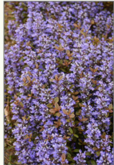
Chocolate Chip Ajuga flowers

Chocolate Chip Ajuga is recommended for the following landscape applications;