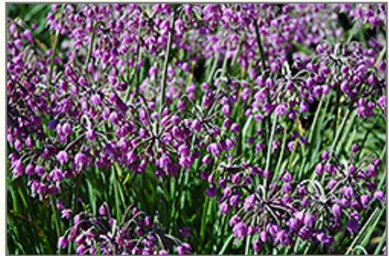
Nodding Pink Onion flowers

This plant will require occasional maintenance and upkeep, and should only be pruned after flowering to avoid removing any of the current season's flowers. It is a good choice for attracting butterflies to your yard, but is not particularly attractive to deer who tend to leave it alone in favor of tastier treats. It has no significant negative characteristics.