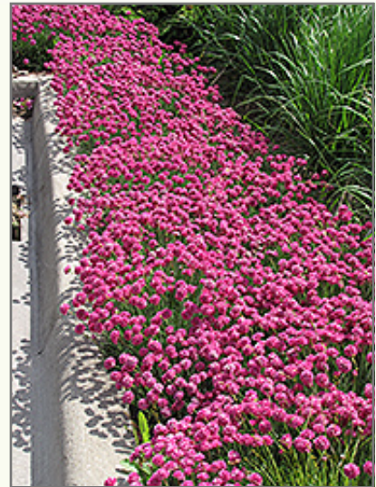
Dusseldorf Pride Armeria in bloom

Dusseldorf Pride Armeria is recommended for the following landscape applications;