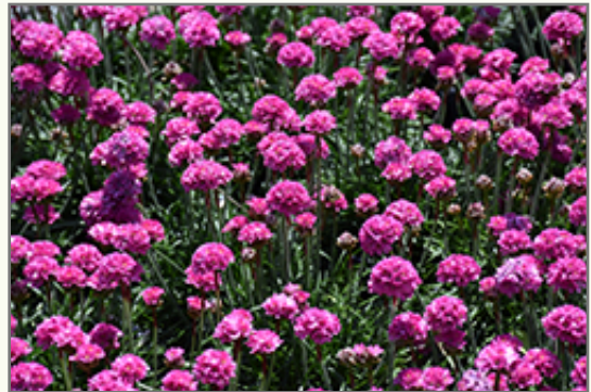
Dusseldorf Pride Armeria flowers

Dusseldorf Pride Armeria will grow to be about 8 inches tall at maturity, with a spread of 15 inches. Its foliage tends to remain low and dense right to the ground. It grows at a slow rate, and under ideal conditions can be expected to live for approximately 10 years. As an evergreen perennial, this plant will typically keep its form and foliage year-round.