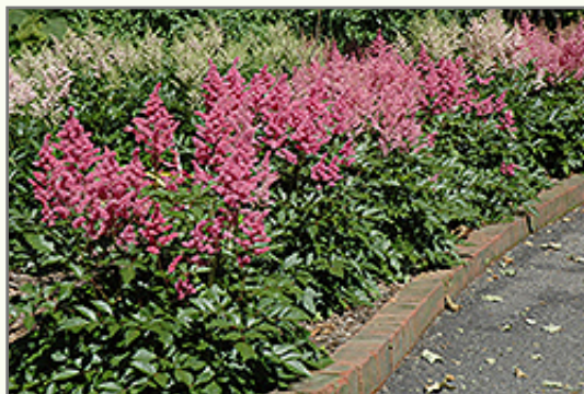
Rheinland Astilbe in bloom