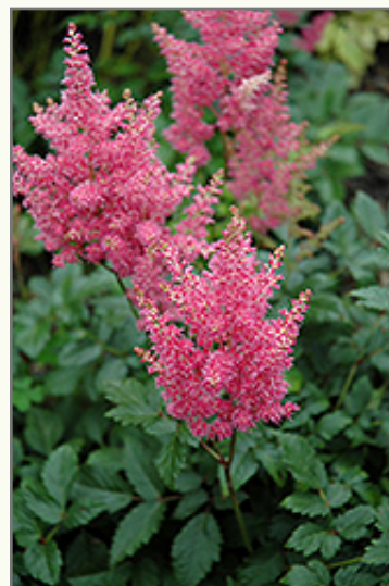
Rheinland Astilbe flowers

Rheinland Astilbe is recommended for the following landscape applications;